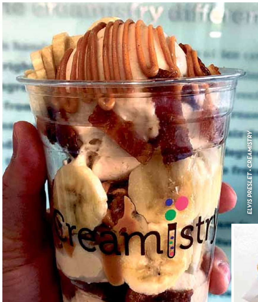
ELVIS PRESLEY • CREAMISTRY

Not only is the ice cream custom-made, but customers can customize their own orders as well. "A customer can choose one of many bases. We have an organic cream base, our signature premium cream base and for any of our lactose intolerant or vegan customers, we also offer a coconut and cashew base. We do also offer sorbets as well," says Cho. Some of us can be easily overwhelmed with too many options, so if that's the case, we have two recommendations for you: