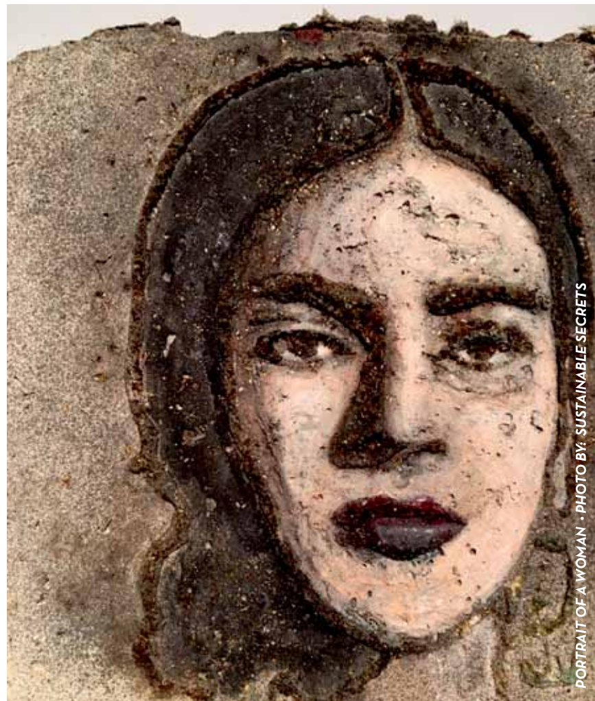
PORTRAIT OF A WOMAN

Be sure to keep up with the Irvine Weekly to stay updated on future news from the local arts scene.