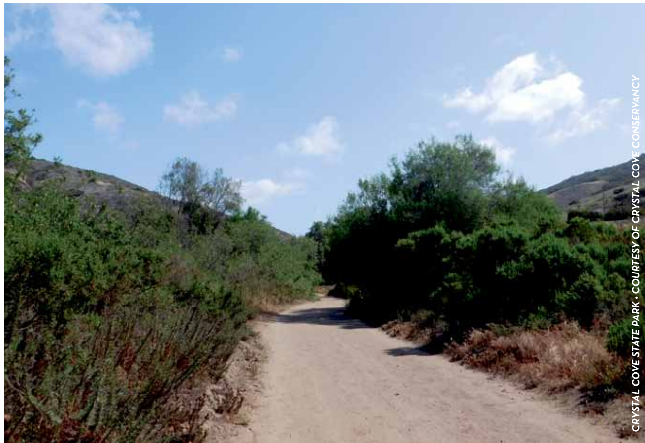
CRYSTAL COVE STATE PARK