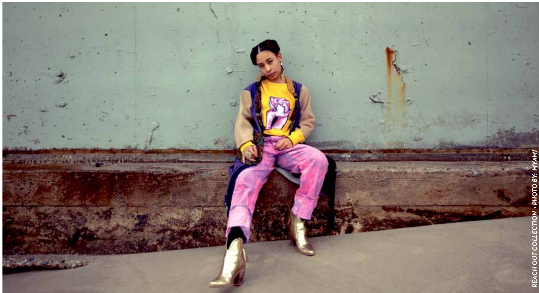
REACH OUT COLLECTION