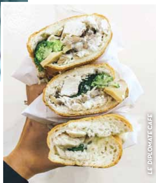
LE DIPLOMATE CAFE

Park. Its French-Vietnamese fusion definitely makes it a unique dining destination.