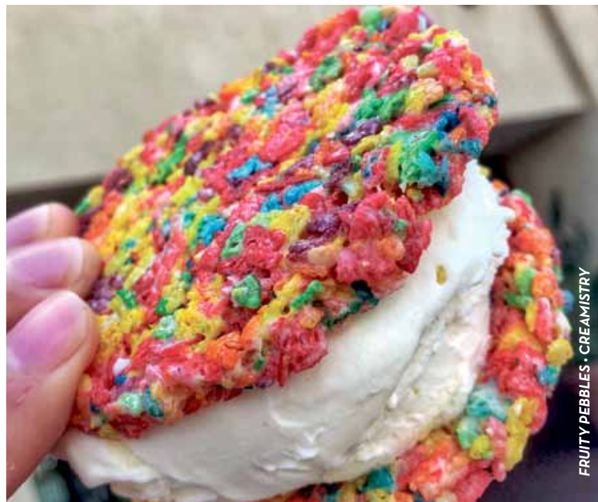
FRUITY PEBBLES • CREAMISTRY