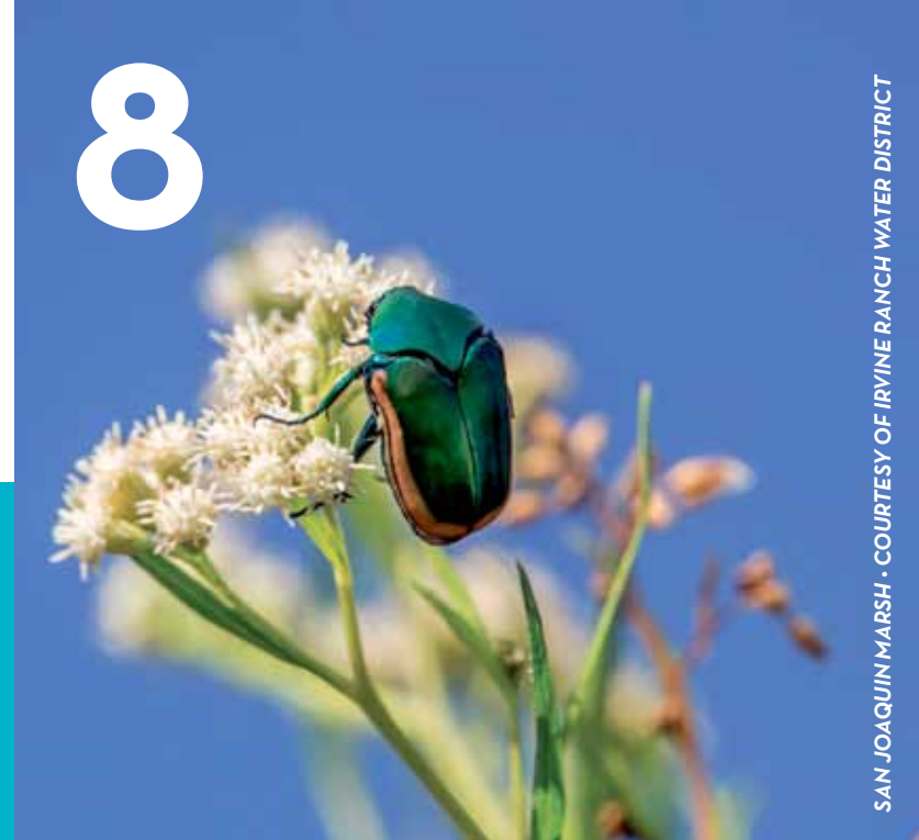
SAN JOAQUIN MARSH