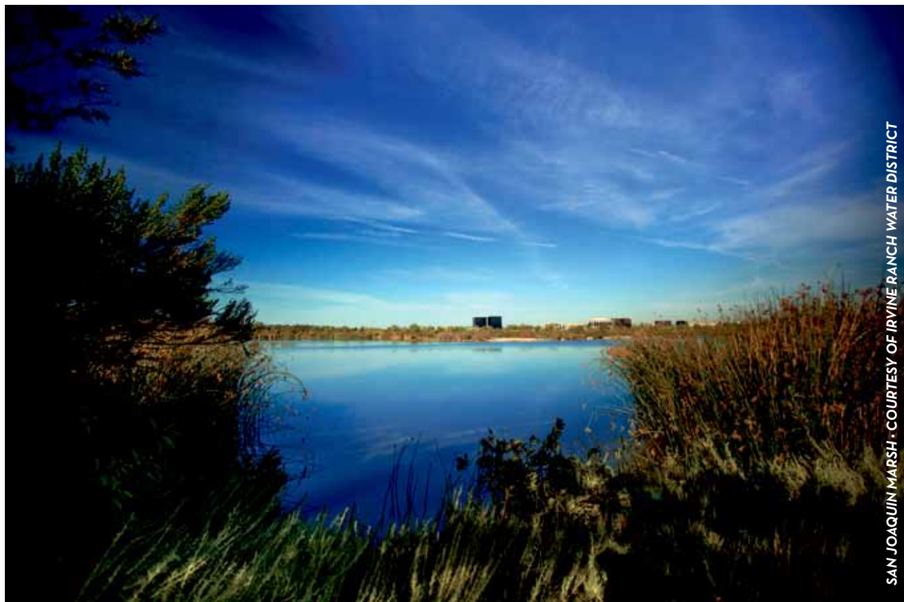
SAN JOAQUIN MARSH