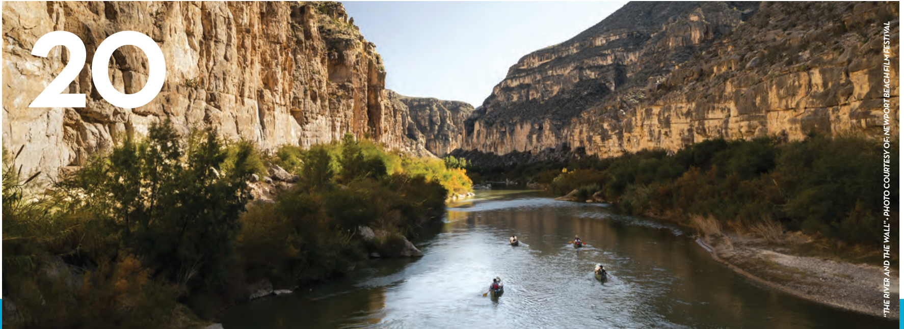
“THE RIVER AND THE WALL”