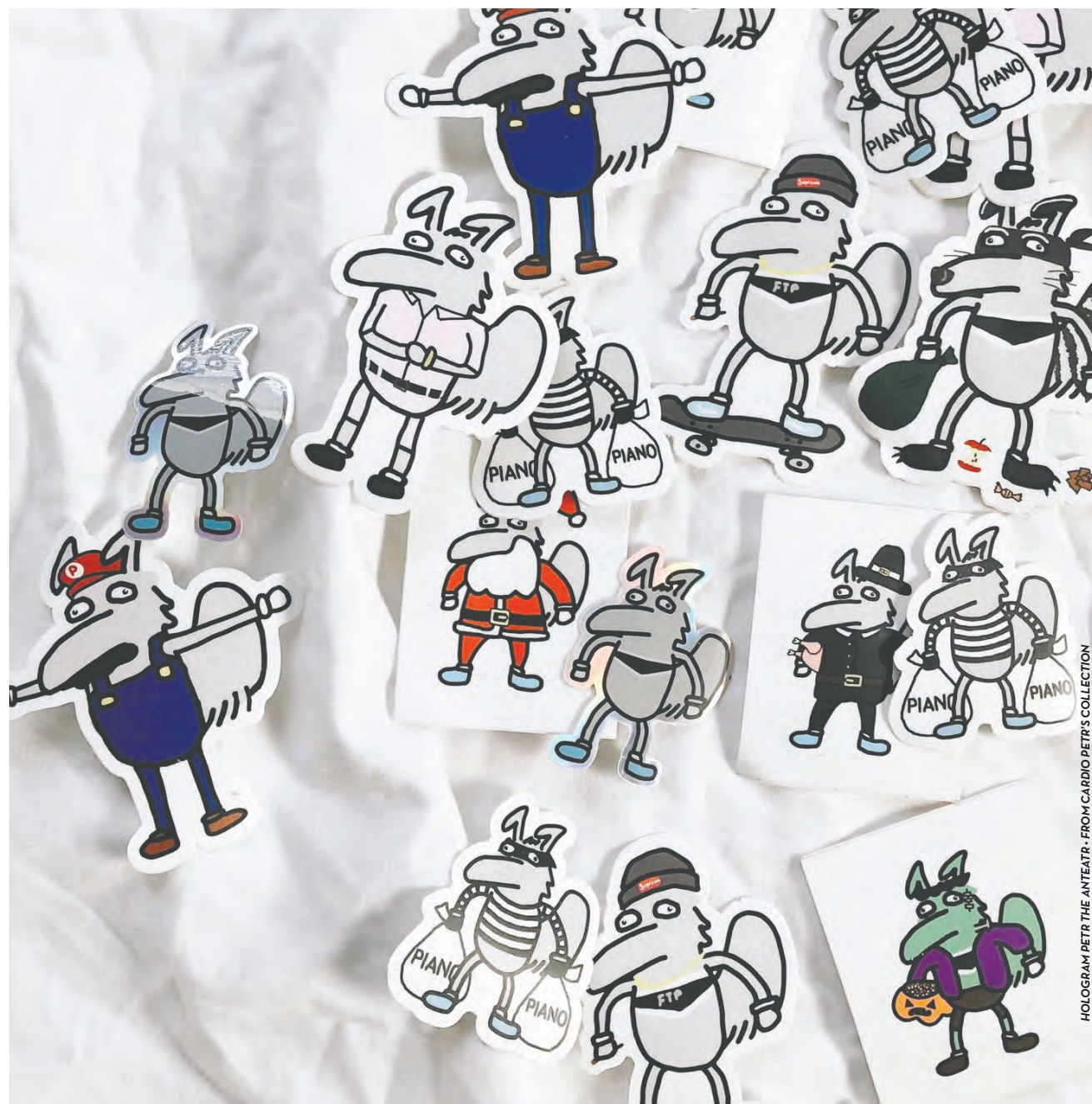
HOLOGRAM PETR THE ANTEATR - FROM CARDIO PETR'S COLLECTION