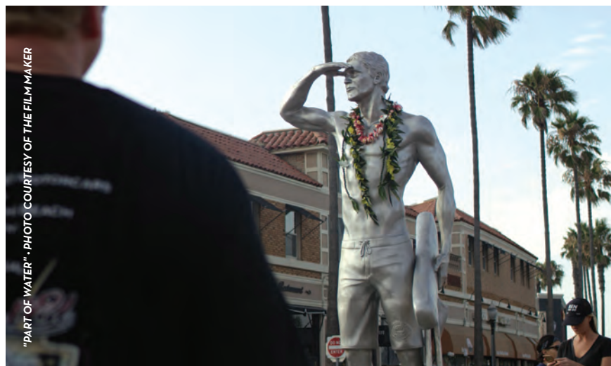
"PART OF WATER".