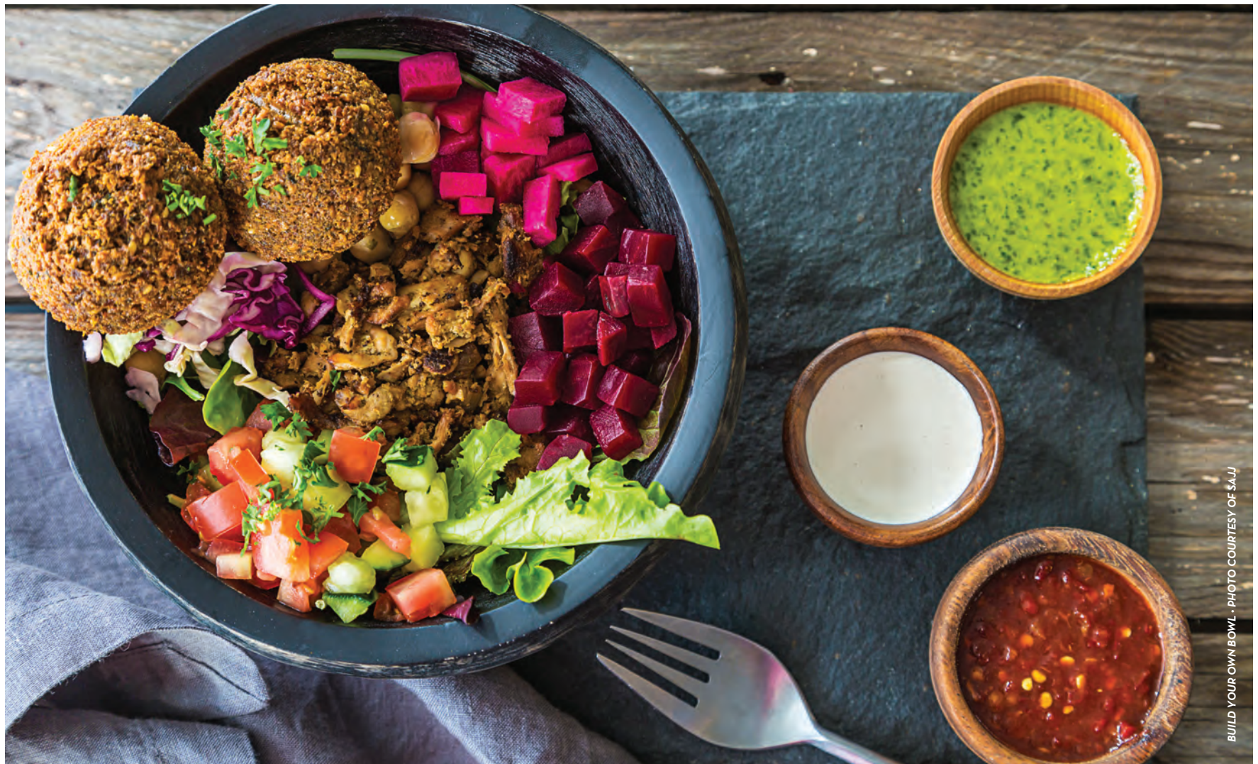
BUILD YOUR OWN BOWL