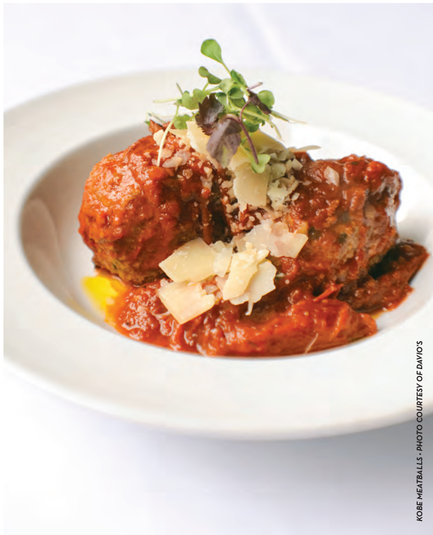
KOBÉ MEATBALLS

During happy hour, which is 4 - 7 p.m. Monday-Friday and 5 - 7 p.m. Saturday and Sunday, American Kobe Beef Meatball Sliders are available for $9 on the Bar Bites menu. No matter if you get the Kobe meatball from the traditional menu, as a $100 meatball or in a slider, it's a unique dish that's so scrumptious, it's definitely worth the drive from L.A. to Irvine.