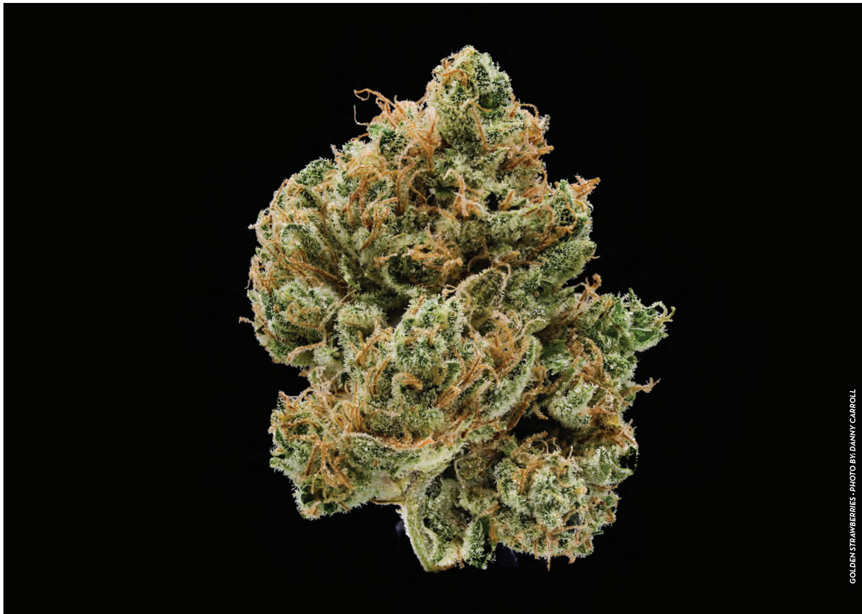
GOLDEN STRAWBERRIES