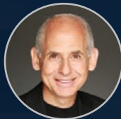
DANIEL AMEN, MD