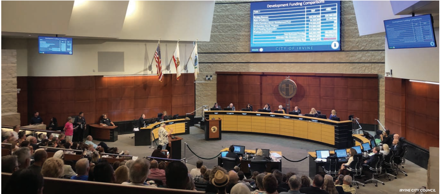
IRVINE CITY COUNCIL