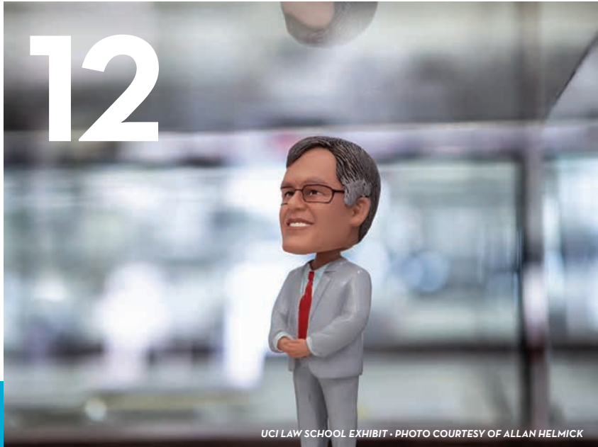
UCI LAW SCHOOL EXHIBIT · PHOTO COURTESY OF ALLAN HELMICK