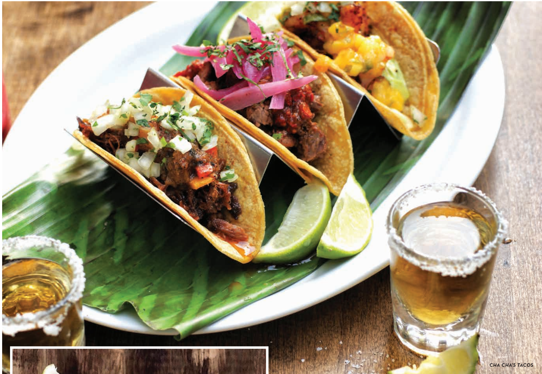
CHA CHA'S TACOS