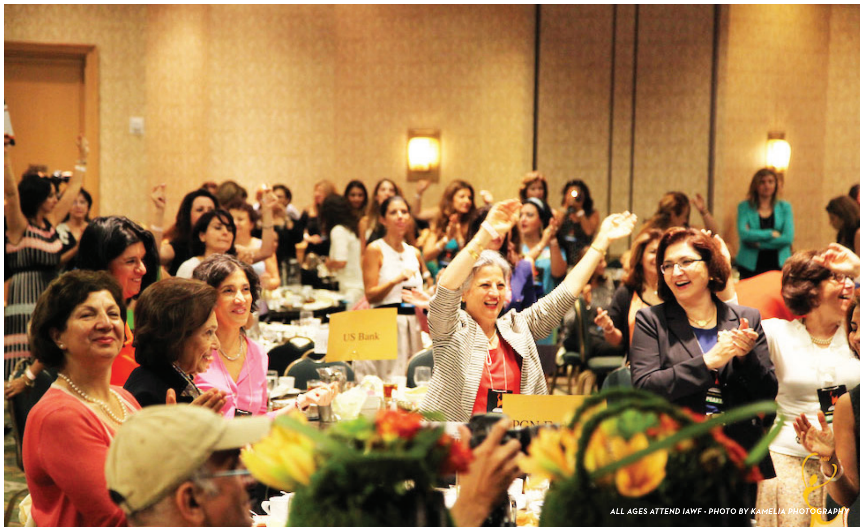
ALL AGES ATTEND IAWF