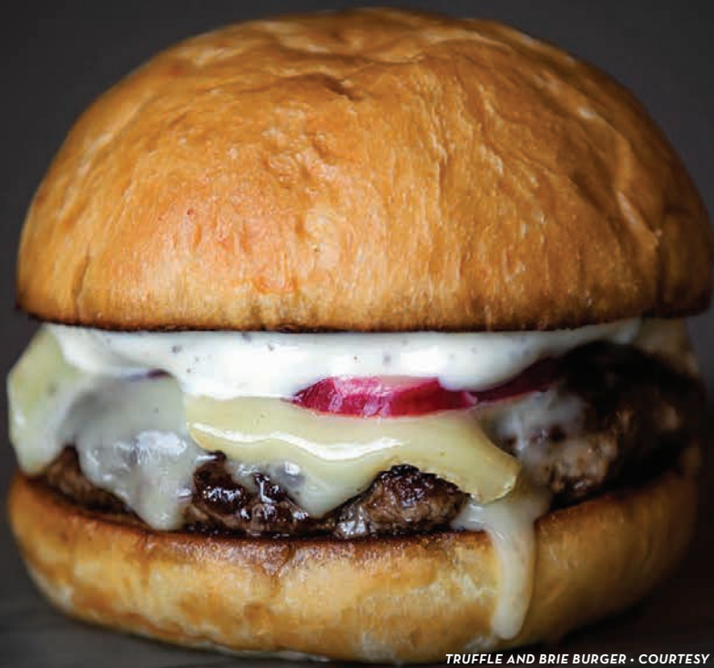
TRUFFLE AND BRIE BURGER