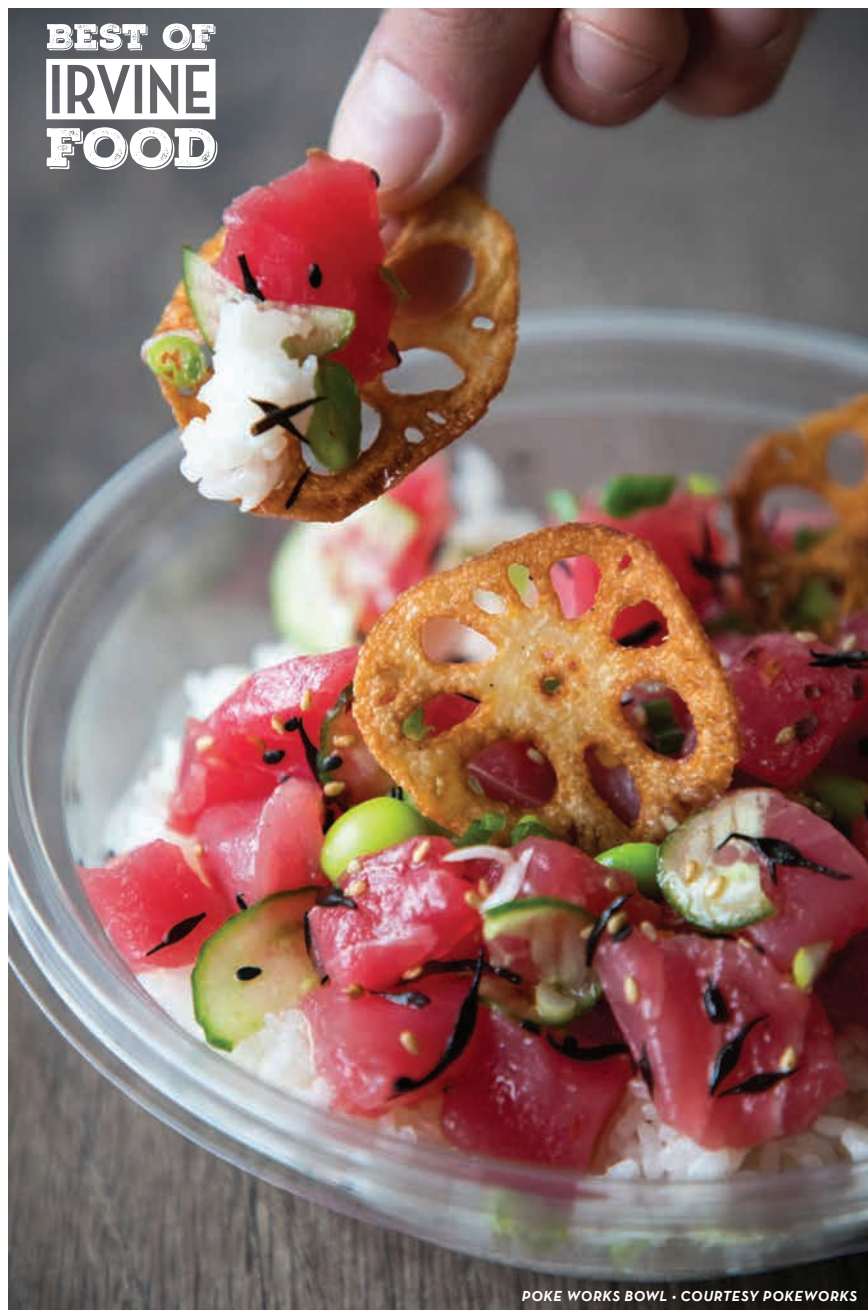
POKE WORKS BOWL

aside from their sauces, and Butterleaf servers known to be very attentive to each customer's dietary restrictions.