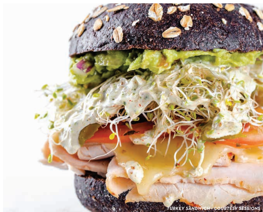
TURKEY SANDWICH