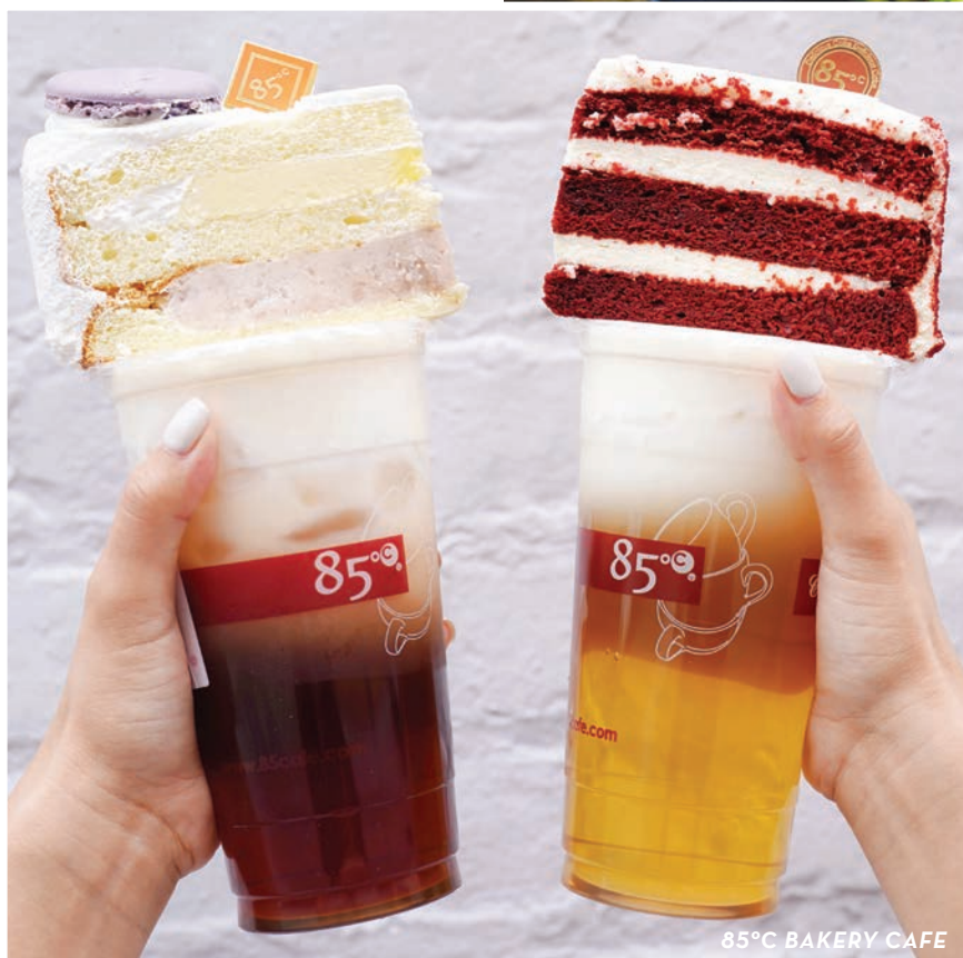
85°C BAKERY CAFE