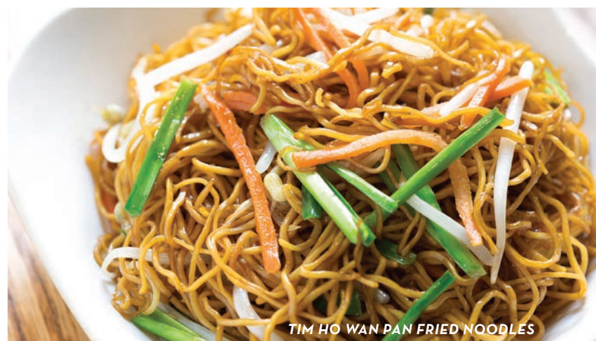
TIM HO WAN PAN FRIED NOODLES

Diamond Jamboree: 2700-2750 Alton Parkway, Irvine, CA 92606, https://www.diamond-jamboree.com