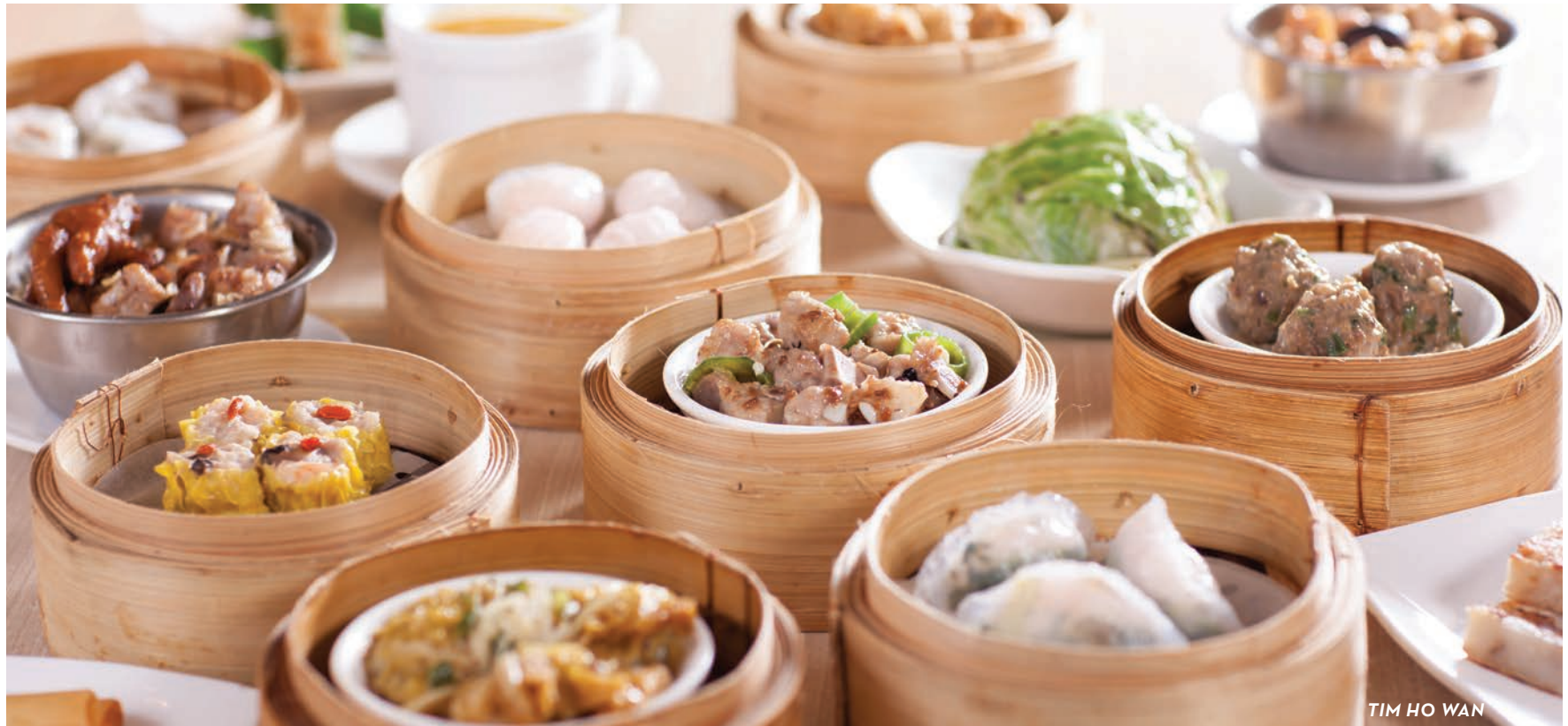
TIM HO WAN