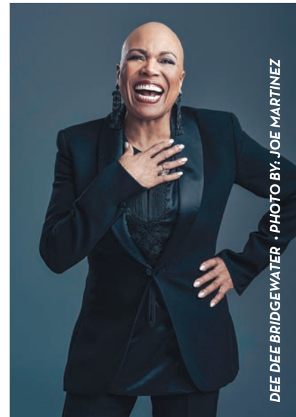
DEE DEE BRIDGEWATER •

Her storied career stretching back to the early 1970s, there's little left in the jazz world for Dee Dee Bridgewater to conquer. Among her generation's most celebrated voices, she's collaborated with the likes of Dizzy Gillespie, Ray Charles and Horace Silver, and scooped a trio of Grammy Awards. Her 2017 collection "Memphis... Yes, I'm Ready" marks a stylistic departure, celebrating Bridgewater's birthplace through strut-