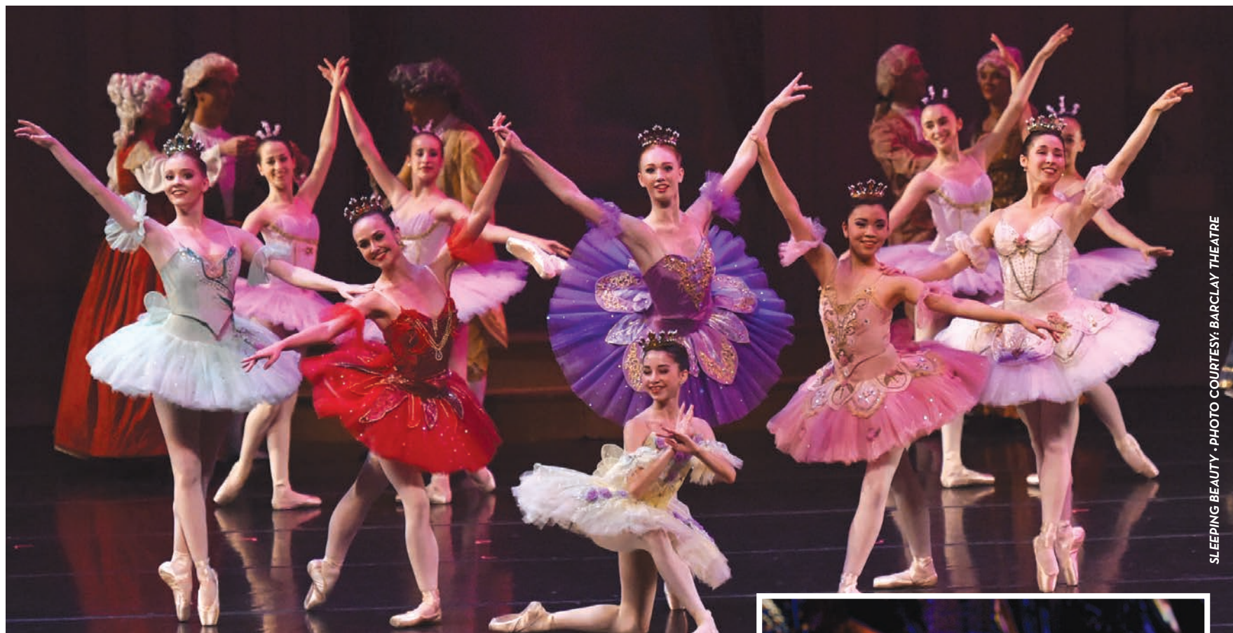
SLEEPING BEAUTY - PHOTO COURTESY: BARCLAY THEATRE