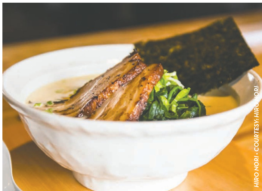
HIRO NORI •

HiroNori Craft Ramen: 2222 Michelson Drive #234, Irvine, CA 92612, www.hironoricraftramen.com