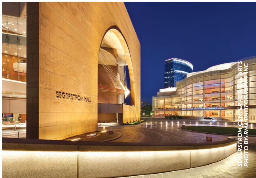
SEGERSTROM CENTER FOR THE ARTS