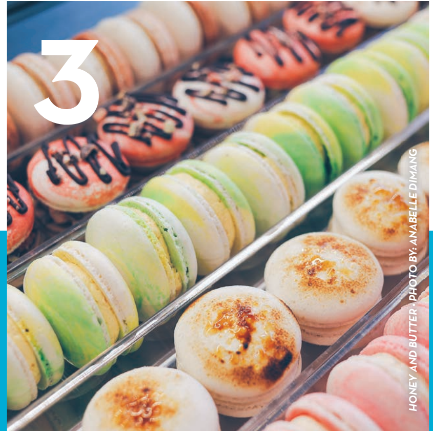
HONEY AND BUTTER