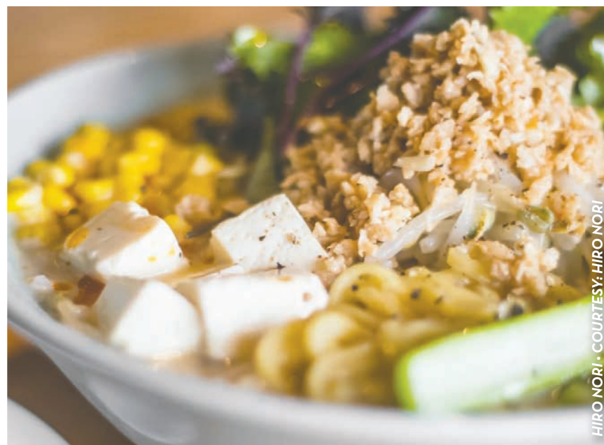
HIRO NORI • COURTESY: HIRO NORI