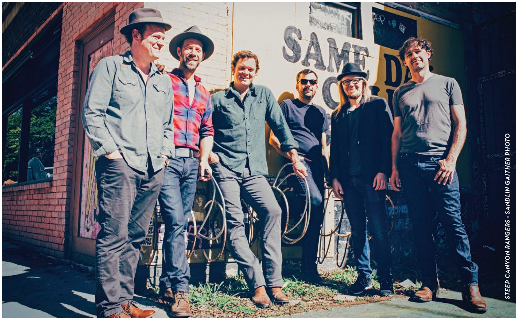
STEEP CANYON RANGERS