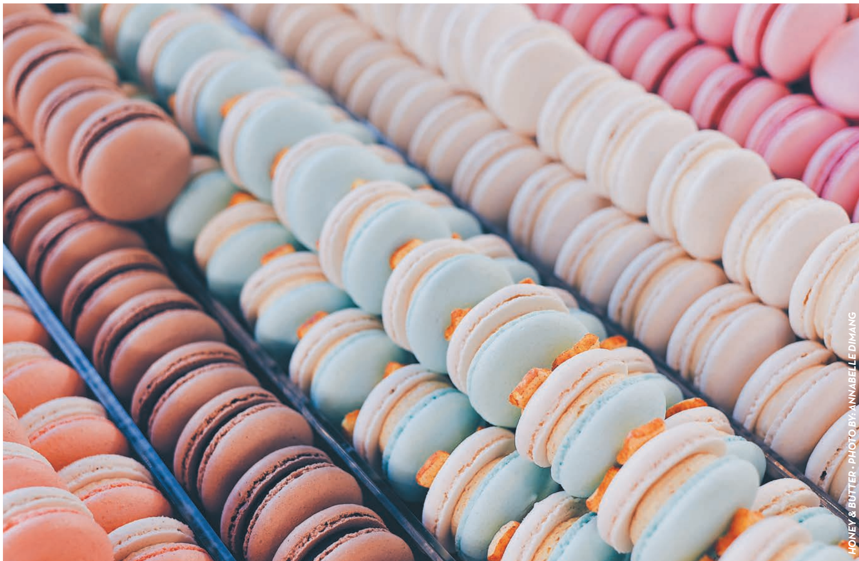
HONEY & BUTTER