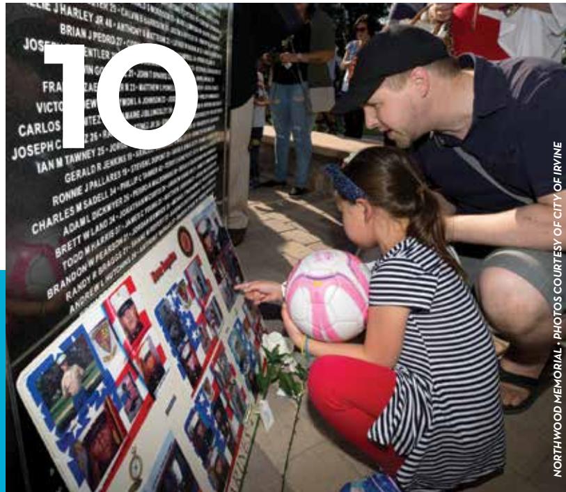
NORTHWOOD MEMORIAL