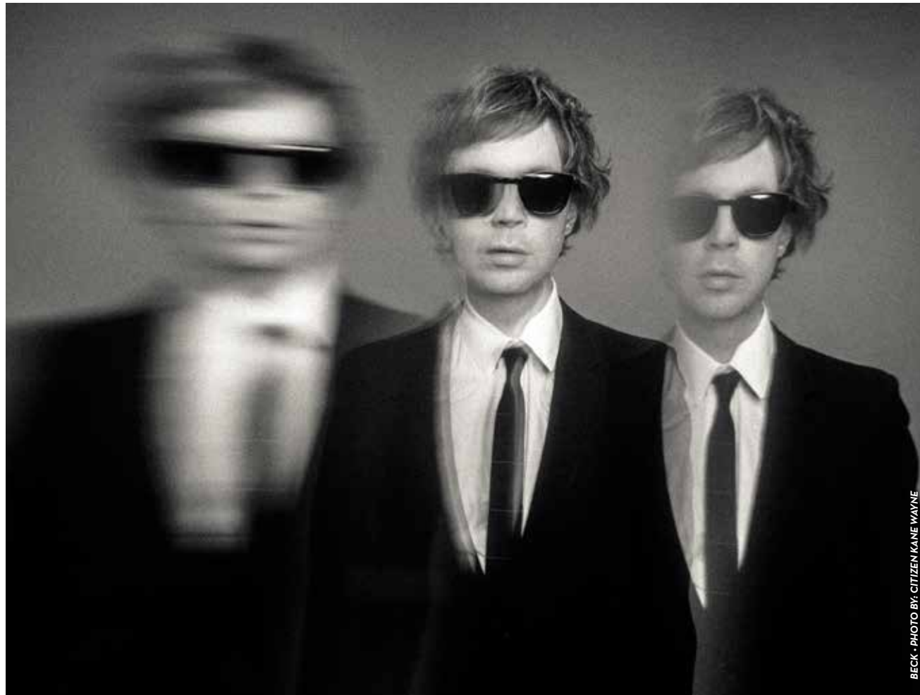
BECK

Sons of Anarchy, at Irvine Regional Park on Aug. 1. Mason Regional Park & Irvine Regional Park