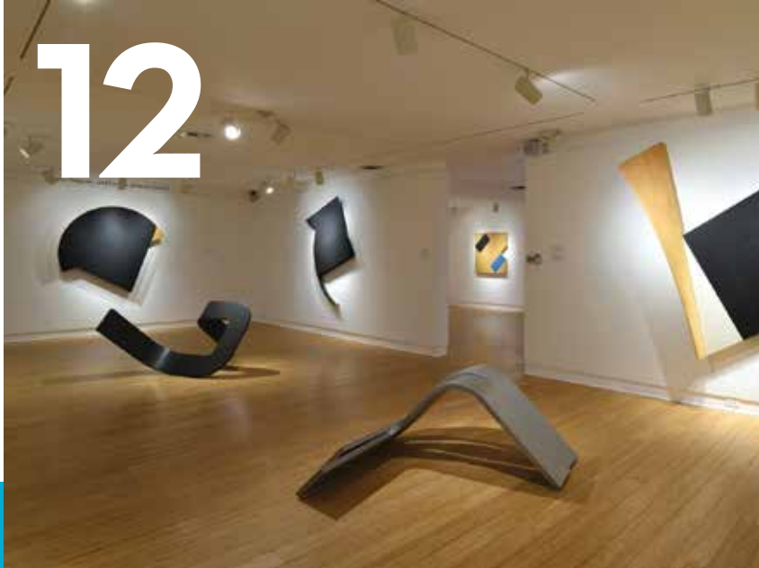
TONY DELAP: A RETROSPECTIVE · COURTESY OF THE ARTIST AND RENA BRANSTEN GALLERY / LAGUNA ART MUSEUM