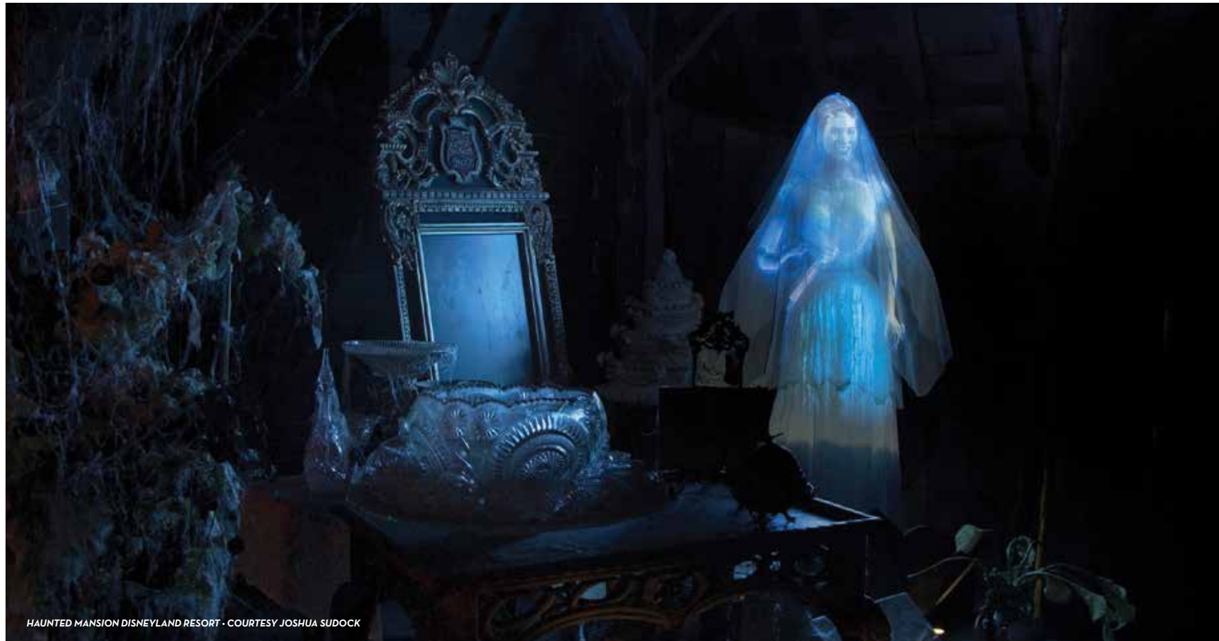
HAUNTED MANSION DISNEYLAND RESORT