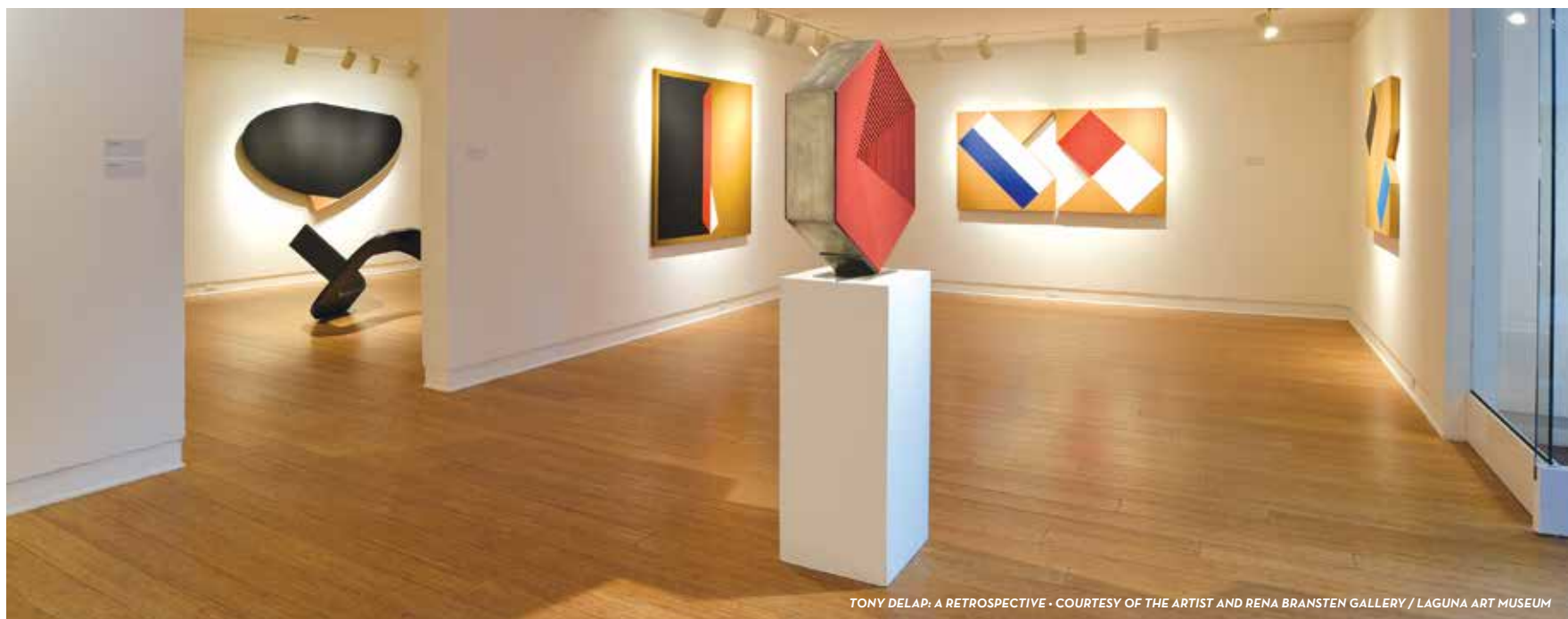
TONY DELAP: A RETROSPECTIVE