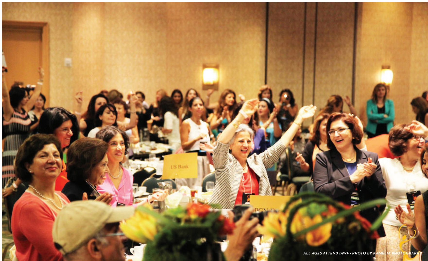
ALL AGES ATTEND IAWF