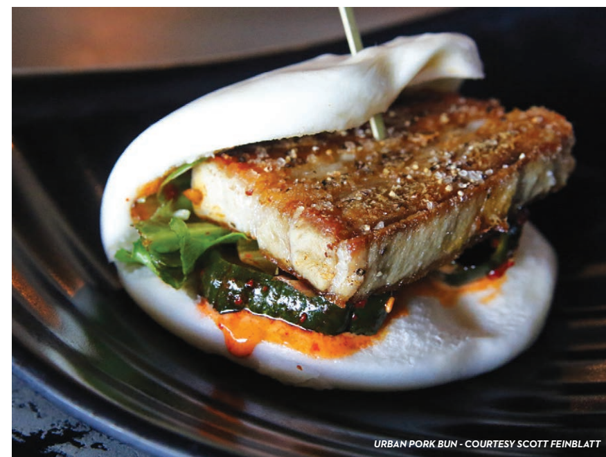
URBAN PORK BUN

When my waitress set my Urban 3B bowl down onto the table, a flying saucer may as well have landed; the thing was enormous. Decoratively presented, of course, the bowl contained: shredded romaine lettuce, purple cabbage, cucumber, carrot, daikon sprout, fried onion, poached egg and sesame oil, all over purple rice (which I chose rather than the white rice) with chili paste dressing. The Urban 3B can be ordered with optional proteins added in the form of: pork belly, gogi, spicy pork, chicken, tofu, spicy tuna and/or kalbi. I went with the three protein option and selected pork belly, gogi and spicy pork. As my waitress instructed me on the preferred consumption procedure, my