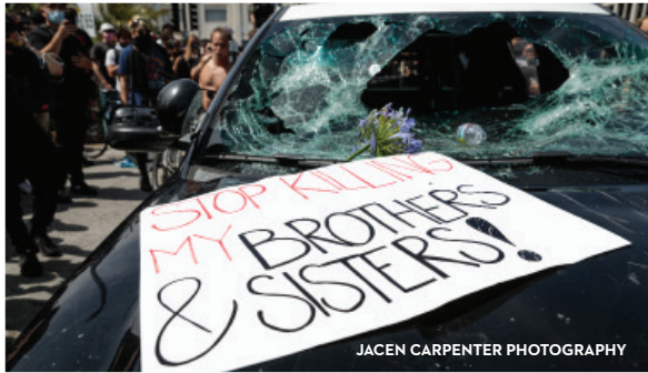
JACEN CARPENTER PHOTOGRAPHY