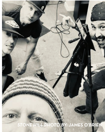
STONE HILL