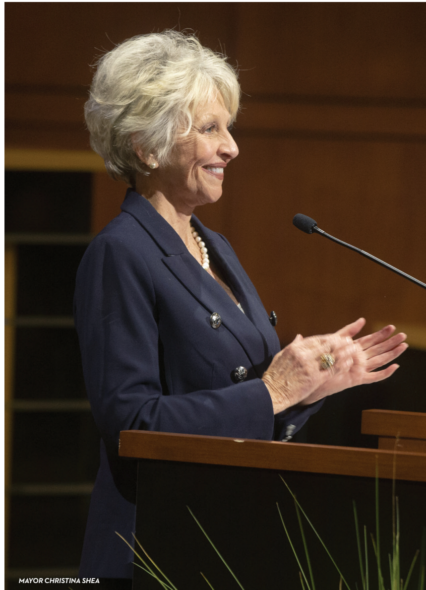
MAYOR CHRISTINA SHEA

Addressing fears voiced by the public at previous City Council meetings, Mayor Shea assured residents that each sustainability and efficiency program is thoughtfully reviewed for financial impact before adoption.