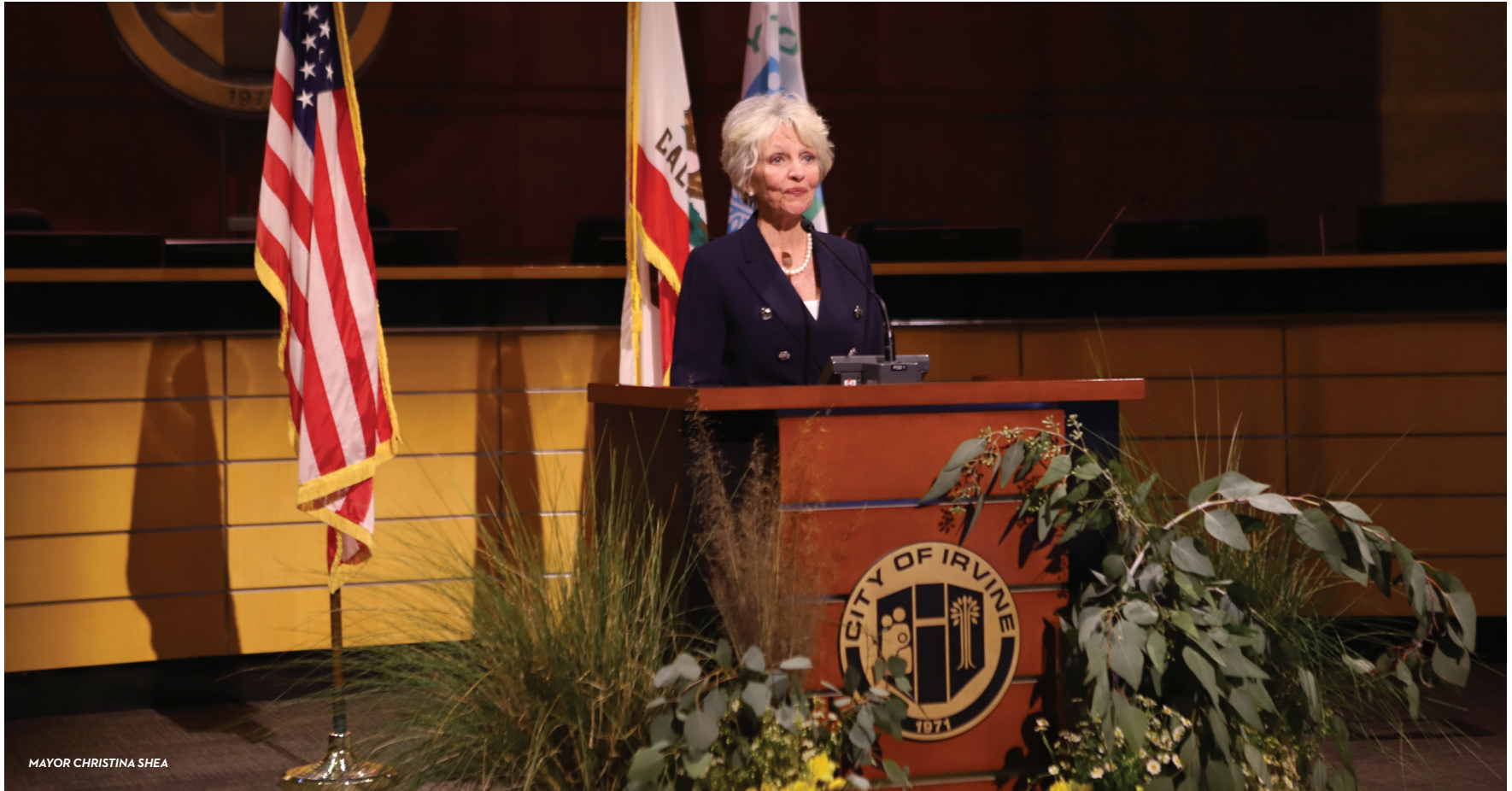
MAYOR CHRISTINA SHEA