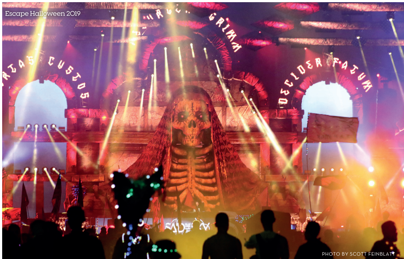
Escape Halloween 2019