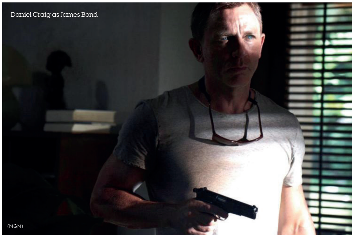
Daniel Craig as James Bond

All too often, the human aspects get lost in the spectacle of a Bond movie. But Fukunaga foregrounds those elements to create something with stakes, heart and depth. He makes sure Craig goes out with a bang, and a box of tissues. With any luck, you'll leave the theater shaken and stirred.