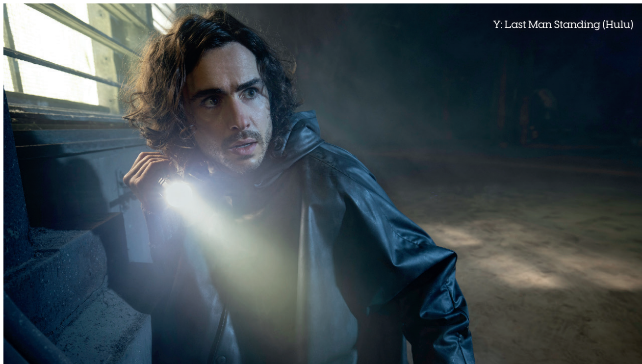
Y: Last Man Standing (Hulu)

Comic book adaptations are plentiful on the small screen, and as more comics get their chance to shine, more unconventional stories get to take center stage, with superheroes taking a backseat. This week we take aim at three distinct comics that are set on destroying the world, one way or another.