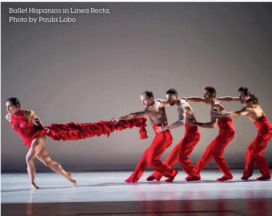
Ballet Hispanico in Linea Recta