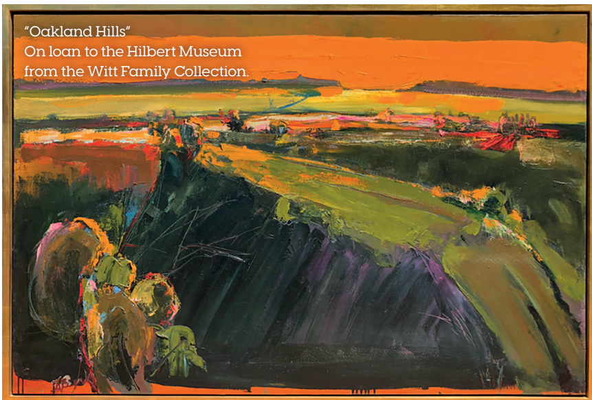
"Oakland Hills" On loan to the Hilbert Museum from the Witt Family Collection.