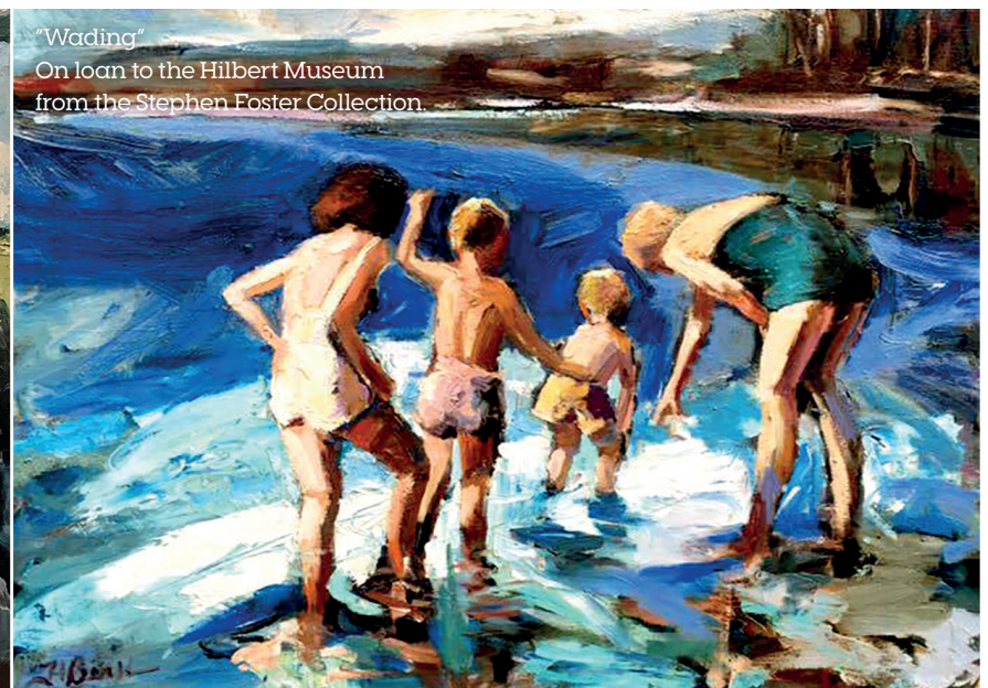
"Wading" On loan to the Hilbert Museum from the Stephen Foster Collection.