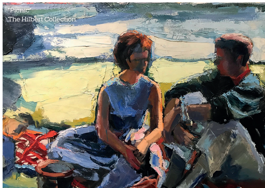
"Picnic" The Hilbert Collection.