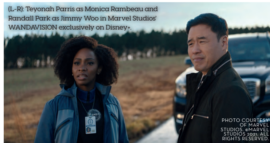
(L-R): Teyonah Parris as Monica Rambeau and Randall Park as Jimmy Woo in Marvel Studios' WANDAVISION exclusively on Disney+.