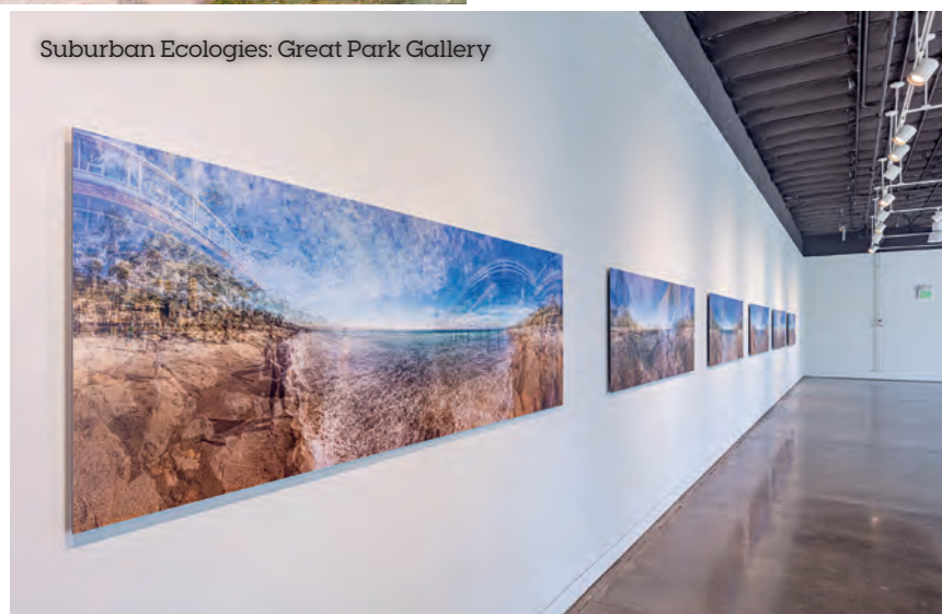
Suburban Ecologies: Great Park Gallery

Another series in this show, “Santa Ana Fall Line,” consists of two pixelated films on opposing walls in the gallery’s main