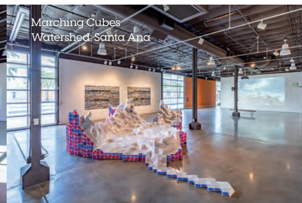
Marching Cubes Watershed: Santa Ana