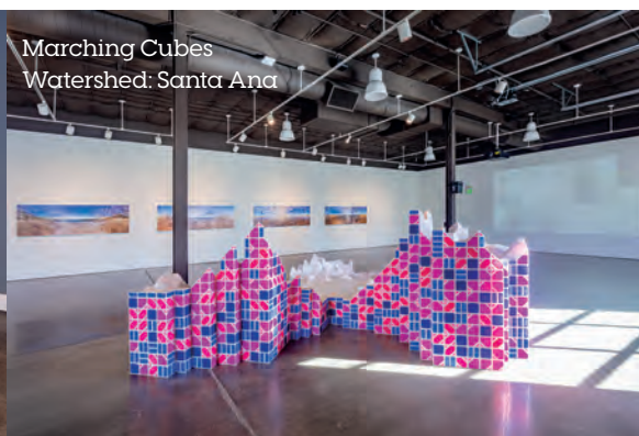
Marching Cubes Watershed: Santa Ana