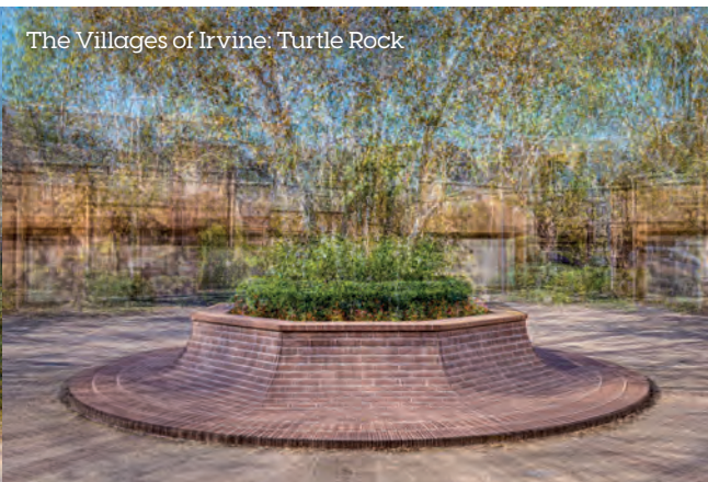
The Villages of Irvine: Turtle Rock