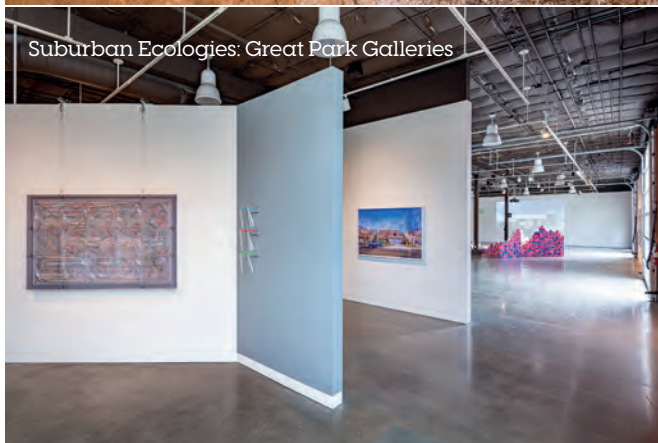
Suburban Ecologies: Great Park Galleries