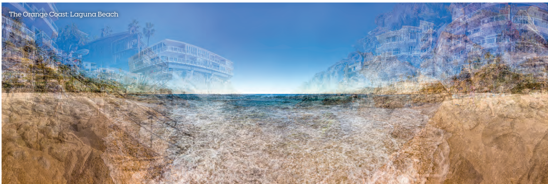
The Orange Coast: Laguna Beach

As a recent Irvine resident (who moved here from Laguna Beach), I often feel as though I am driving through an imaginary village. I marvel at the flawlessness of the city with the trees and bushes trimmed to near perfection, and the cohesiveness of the housing.