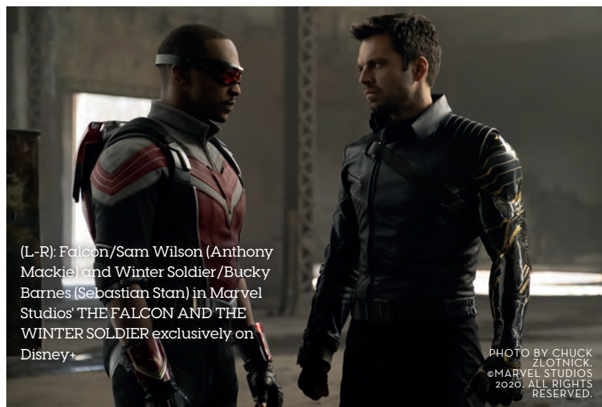
(L-R): Falcon/Sam Wilson (Anthony Mackie) and Winter Soldier/Bucky Barnes (Sebastian Stan) in Marvel Studios' THE FALCON AND THE WINTER SOLDIER exclusively on Disney+.