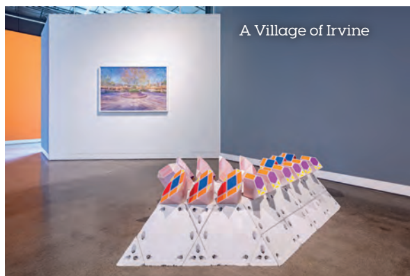
A Village of Irvine