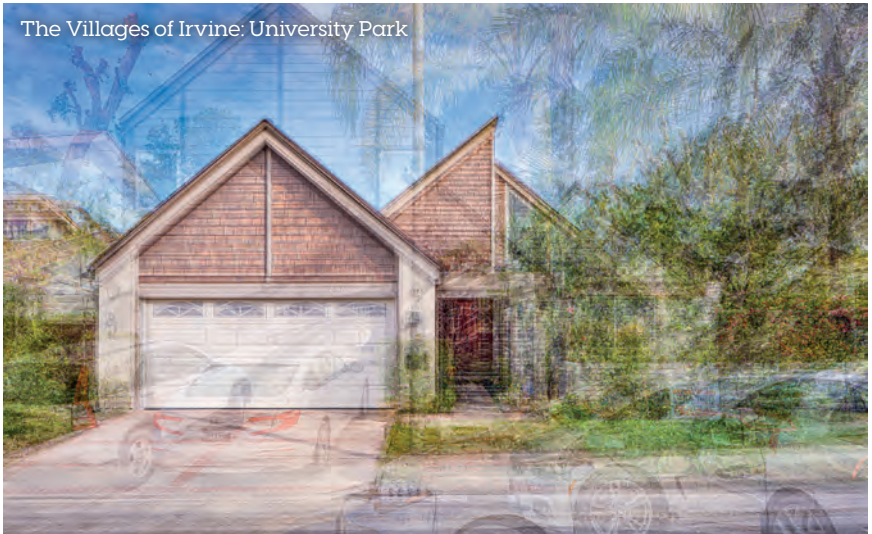
The Villages of Irvine: University Park

TO ADVERTISE CONTACT US AT PUBLISHER@IRVINEWEEKLY.COM