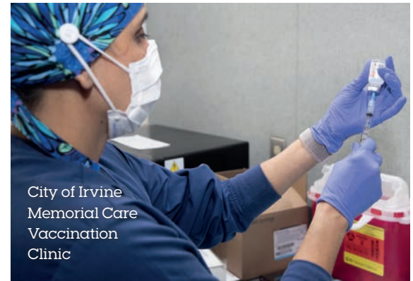
City of Irvine Memorial Care Vaccination Clinic

In his update Tuesday, Newsom added that he wanted to see schools open for in-person education