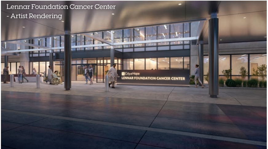
Lennar Foundation Cancer Center - Artist Rendering

Mechanical Engineer (Irvine, CA). Design & dvlpg a wide variety of electrical based, consumer products that can integrate w/ the vehicle using Catia V6. Must possess a Bachelor's degree or foreign equivat in Mechanical Engrng or a closely reitd field & 5 yrs of prgrssvly responsible exp w/ auto design engrng. Exp must incl the followg skills/tools/technologies: Product Lifecycle Mgmt using Enovia; CAD design using Catia V5/V6 for solid & surface modelg; Exp w/ pkgaging components, designing sheet-metal bracket & injectn moulded parts for electrcd products; Creatg drawngs & a high degree of competence w/ GD&T; Experience using JAMA, JIRA, & Confluence. Email res to Rivan Automotive, LLC, Attn: Mobility, Job Ref #: ME21, hrmobility@rivan.com