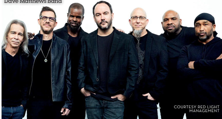
Dave Matthews Band

1990s. But while the quintet was indeed at the forefront of marrying rap, hard rock, and darkly confessional/confrontational lyrics, they've ensured their longevity by repeatedly probing outside their own template. Over the course of 13 studio albums, they've dabbled with melody (2002's Grammy-winning Untouchables ) and electronica (2011's The Path of Totality ), while periodically circling back to their rep-making ultra-dynamic, tortured and defiant bombast. While there have certainly been missteps (notably 2007's untitled effort), it's Korn's willingness to take commercial risks that's earned them respect far