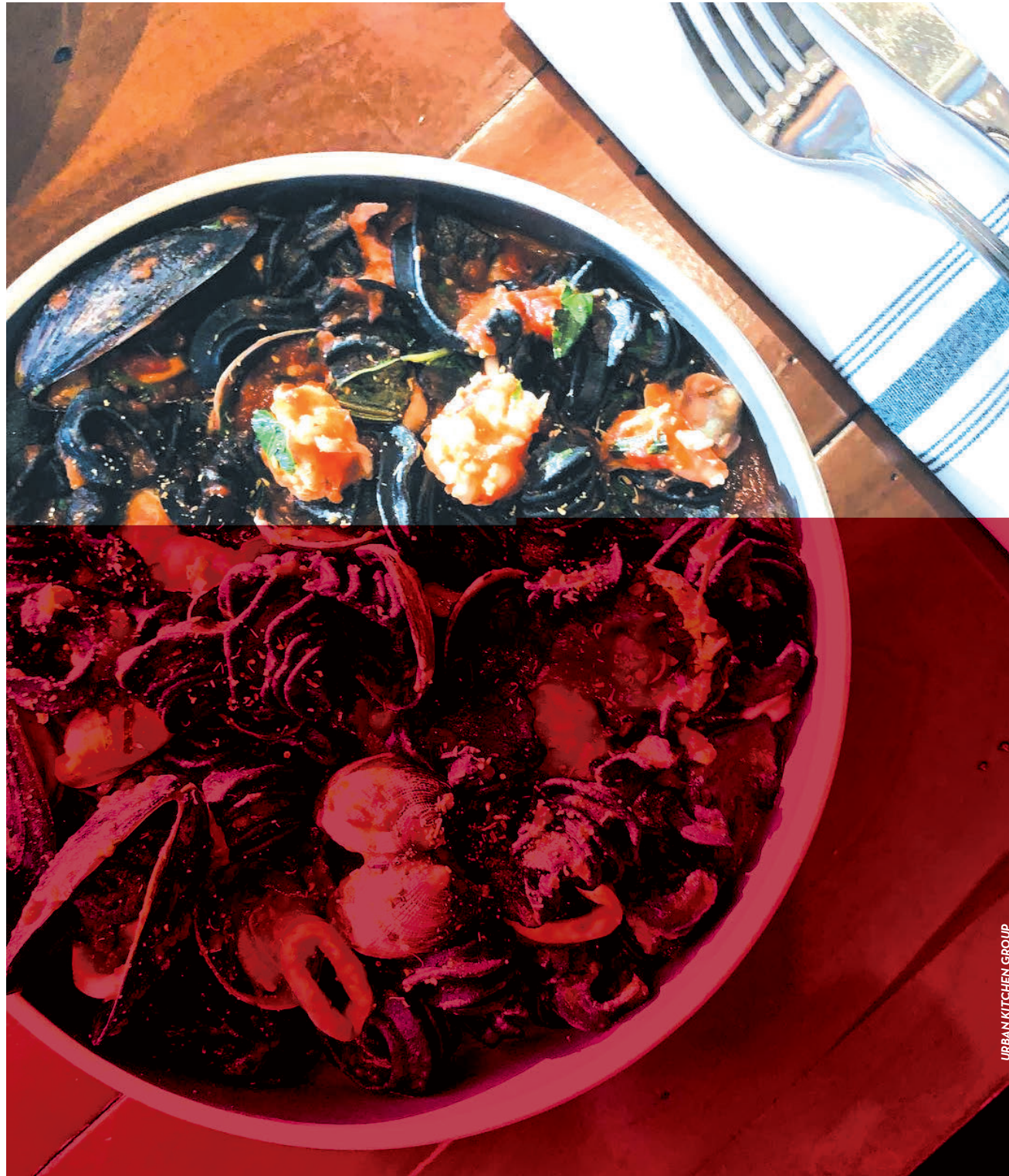
URBAN KITCHEN GROUP