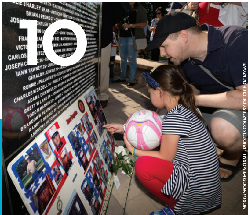
NORTHWOOD MEMORIAL