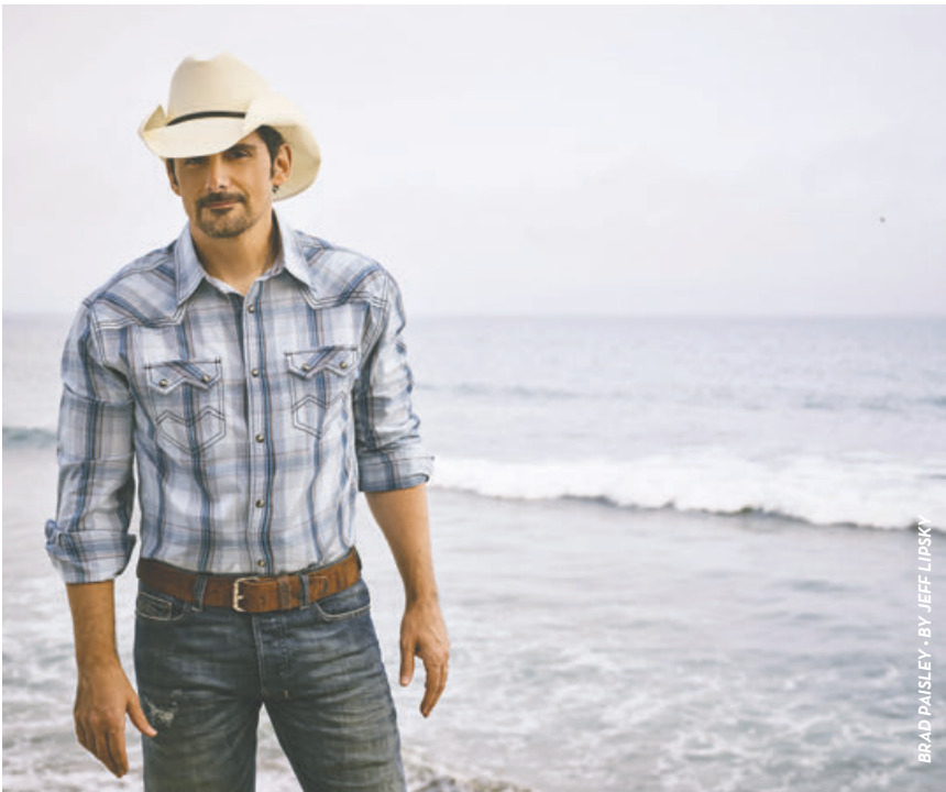
BRAD PAISLEY

FivePoint Amphitheatre, 14800 Chinon, Irvine.