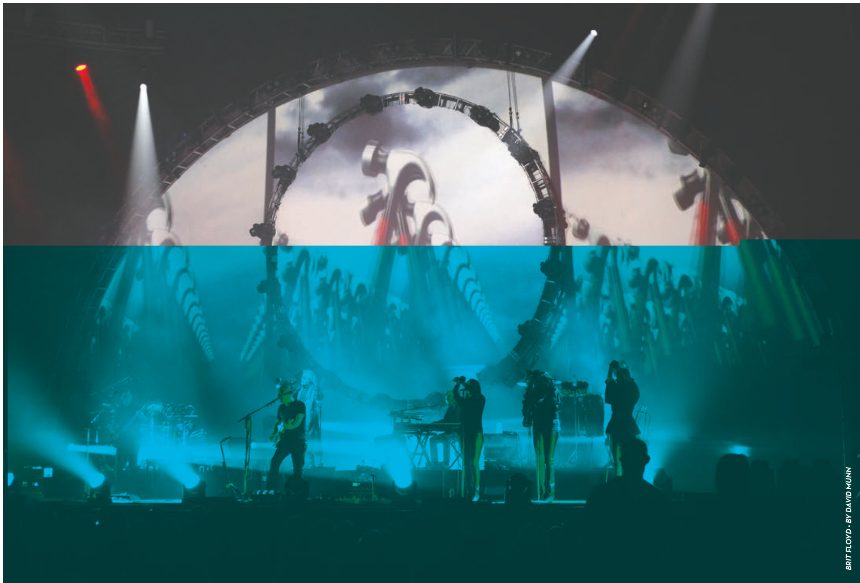
BRIT FLOYD •