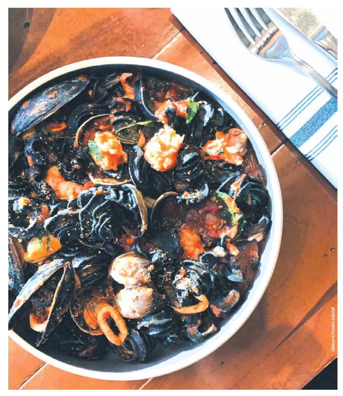
DISHES WORTH THE DRIVE

FROM THE COMPARATIVELY DELICATE BEETS & CITRUS SALAD TO A MONSTROUS 21/2-LB. STEAK.