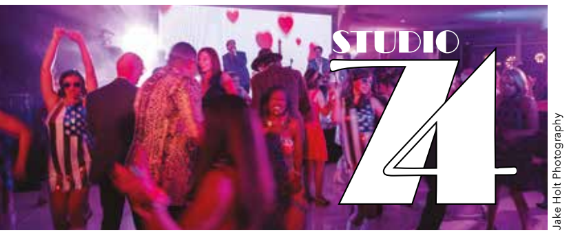
Modernism Show Preview Party February 17 | 6–9 p.m. | Palm Springs Convention Center

Premier Double Decker Architectural Bus Tour Charles Phoenix Super Duper Double Decker Bus Tour Twilight Bus Tour Bella da Ball's Celebrity Homes Bus Tour